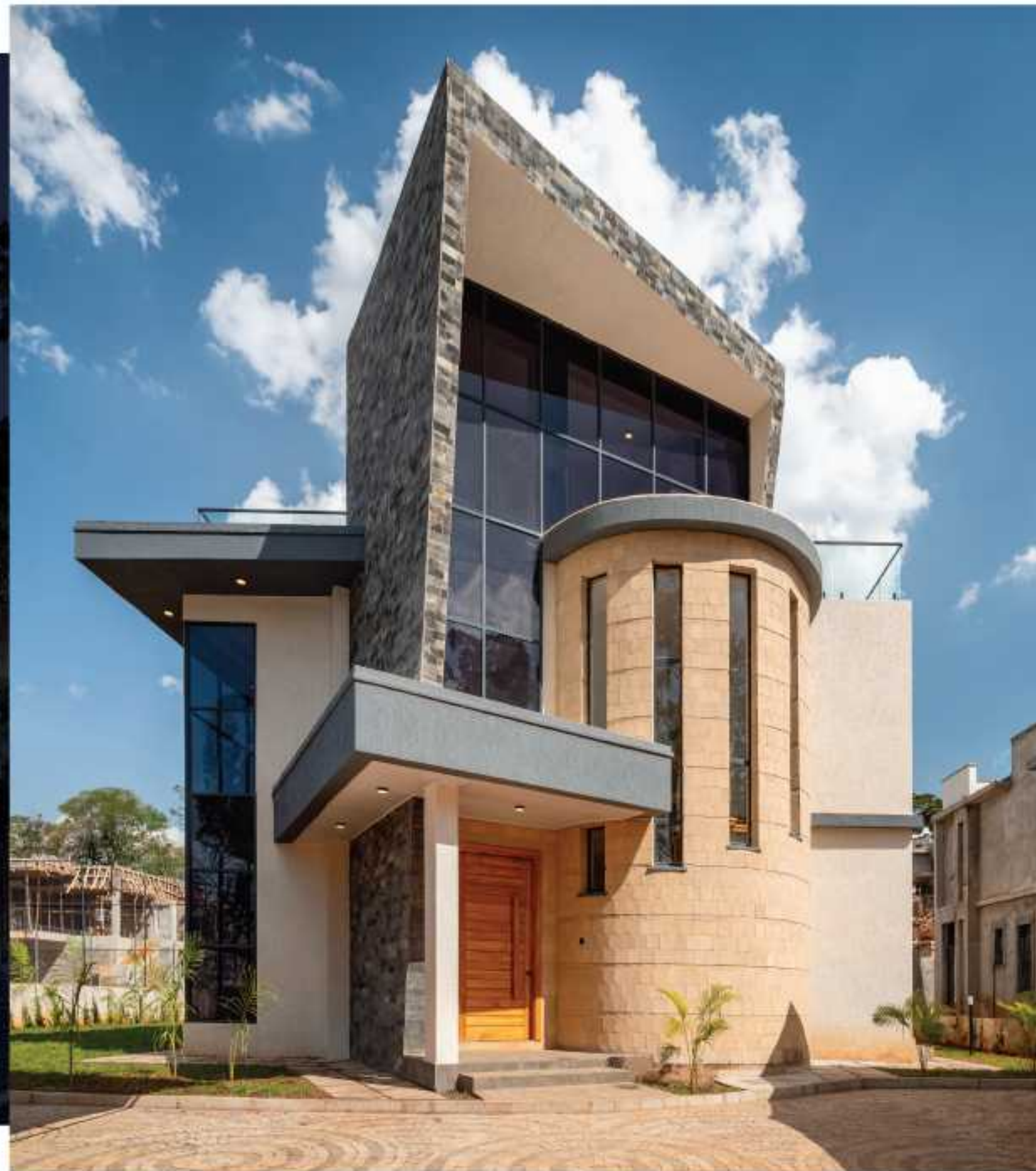
A Half's Impression