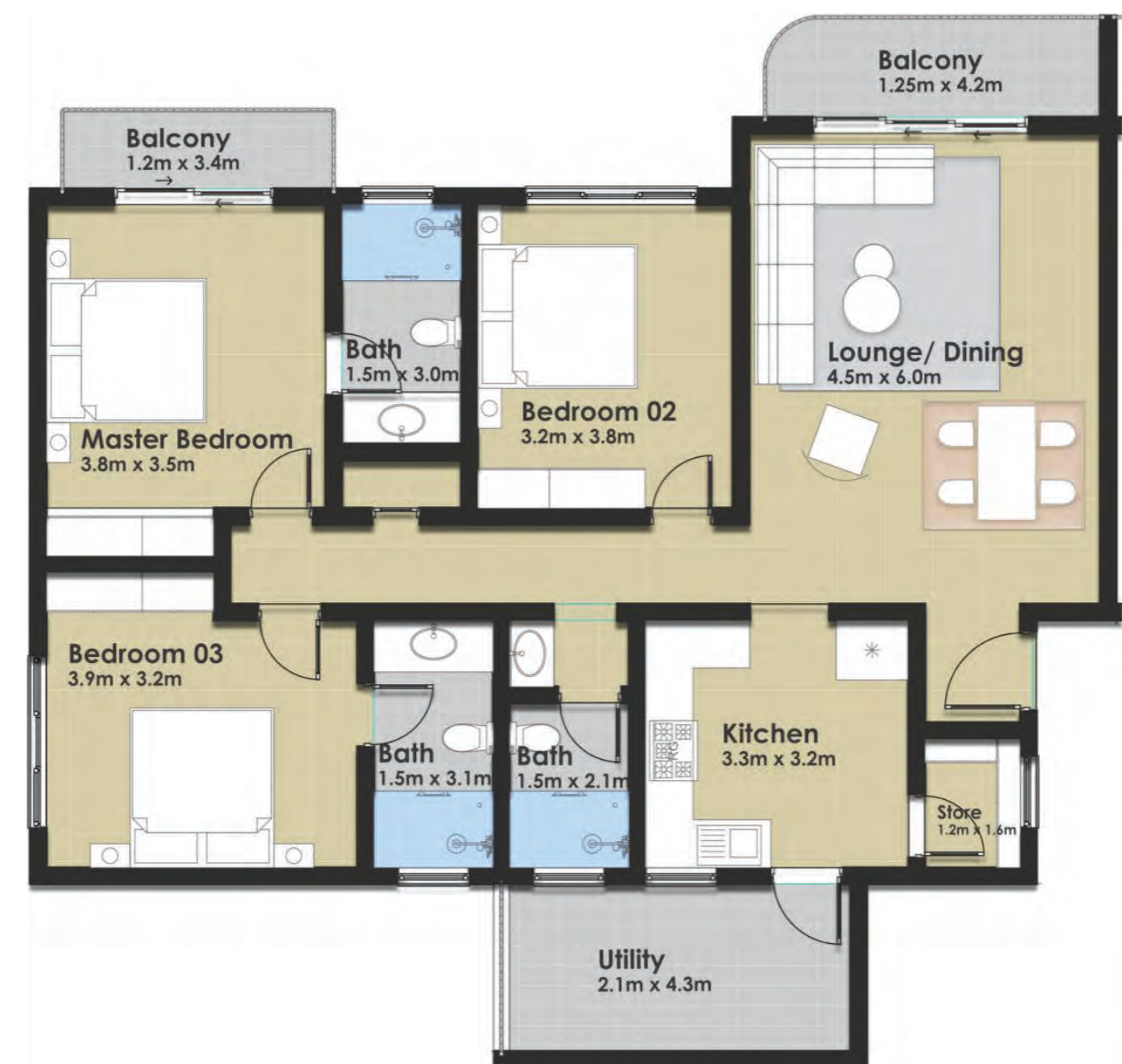
3 Bedroom - 1550 sq ft / 145 sqm